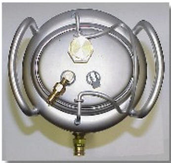
Wide Mouth Oval Opening on Top of Canister for Easy Filling