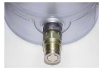
Canisters are available fitted with 3/4" Snap-Tite EA Series Coupler or 3/4" Dry Break Couplers