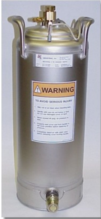
5 Gallon Ink Canister is the same "coke can" that is utilized in most major newspaper pressrooms