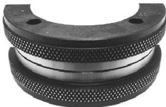
3/8" Face Nip Ring

We offer our nip rings Wire EDM cut all the way thru the part which will leave approximately a .010 gap when the ring is mounted or Wire EDM cut to the edges of the ring and then cracked so as to leave no gap in the circumference of the ring. Many of our customers agree with us that the Wire EDM cut thru rings mount much easier and the .010 gap doesn't affect the performance of the ring. Check out our very competitive prices for these high quality nip rings. Give us a call if you don't see the nip ring part number your folder uses. We more than likely already make them and have them in stock ready to ship. And by the way, we don't charge extra if you want your nip rings narrower than the normal 5/8 inch, such as 3/8 inch. We stock nip rings in both 5/8 inch and 3/8 inch.