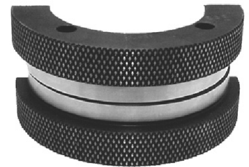
5/8" Face Nip Ring