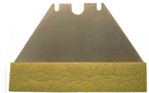
PPP-104197 Age Roller Sponge